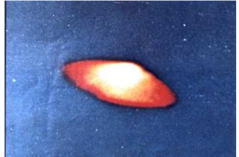
“Chariot of Fire”

II Ki 2:11 And as they still went on and talked, behold, a chariot of fire and horses of fire separated the two of them. And Elijah went up by a whirlwind into heaven.