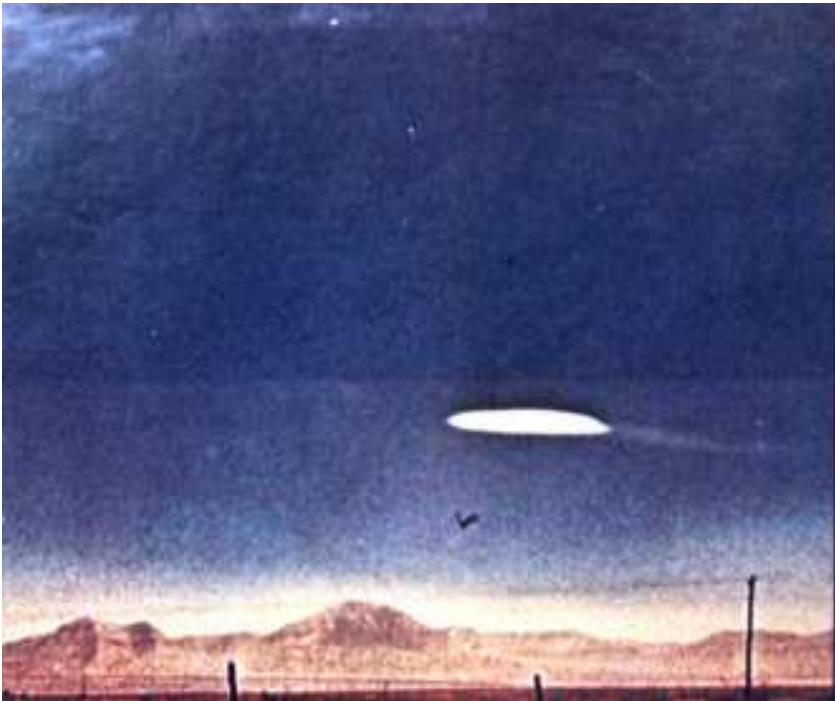
Photograph of a Seraphic Transport taken by Ella Louise Fortune, a nurse with the Bureau of Indian Affairs, Mescalero Reservation, New Mexico, October 16, 1957. Note that the object has the appearance of a white misty cloud in an otherwise cloudless sky. A small "trail" may be seen to the right of the object. The course grain of the photograph is due to repeated reproduction and copy from news media.

For information purposes I include here some photographs that may help the reader to recognize the types of sightings which take place. A remarkable element of our experience is the large lack of good photographic records. Our Visitors are definitely elusive in providing permanent evidence.