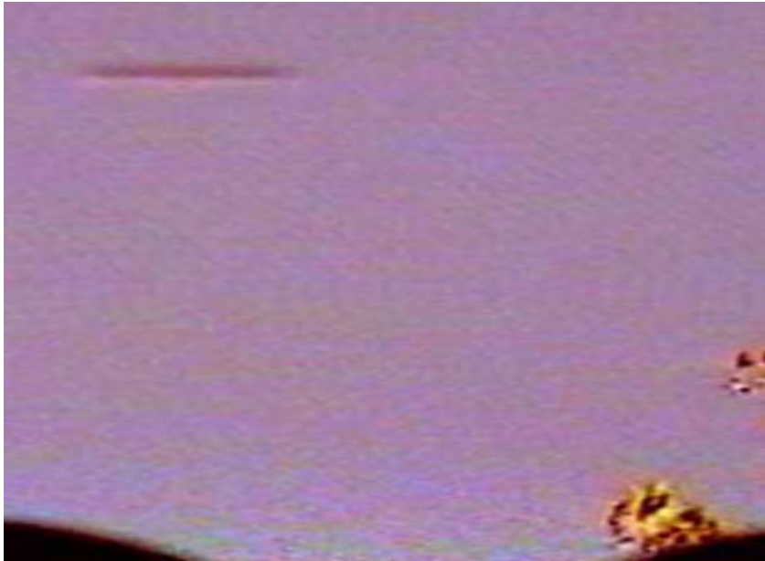
Two Seraphic Transports. Date, circumstances and photographer unknown.