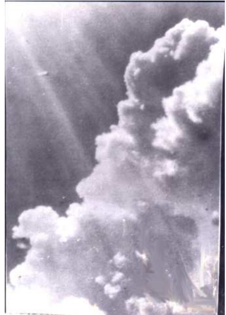
Photograph of a Seraphic Transport at Fujisawa, Japan. The date is unknown, but probably early 1960's. The object is in the upper left.